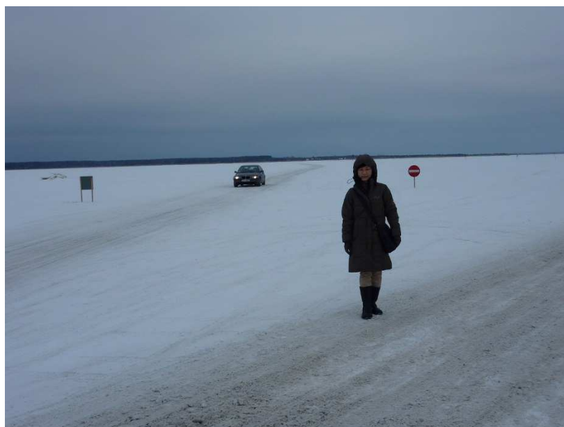
Ice road between Haapsalu and Noarootsi peninsula.

In the memorial church of the Estonian soldiers, there is a unique altar that consists of millstones brought from three different places in Estonia. The stones that have ground bread