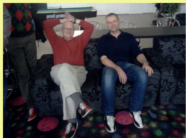
Directing staff members saving their energy for the next roll.