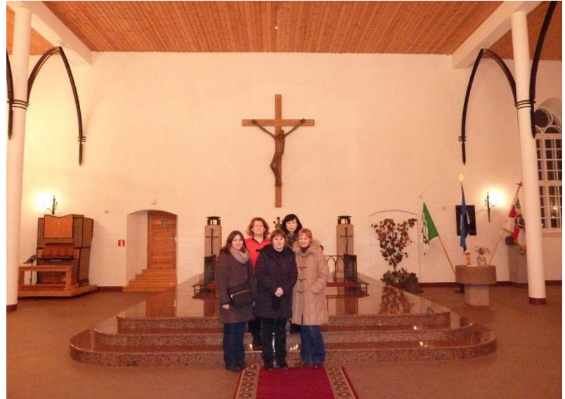
Baltgirls at the Haapsalu Episcopal Church.