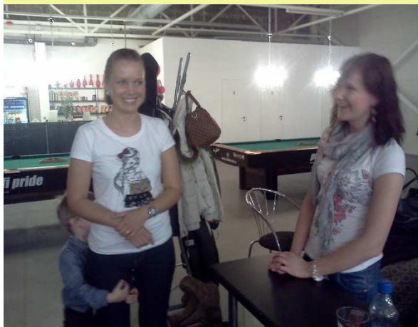
Next time extra points for the most graceful roll?

the prize for most of the time. Six different kinds of competitions have been carried out since the event was initiated. Last time for the OPD team to win the Cup was the Archery Competition in Autumn 2010.