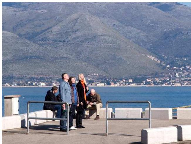
Baltic penguins on the docks.

about this so ancient city. For the Americans 200 years is already great history. Guided trip ends in Vatikan. Going inside the gigantic church. Amazing view. Re-