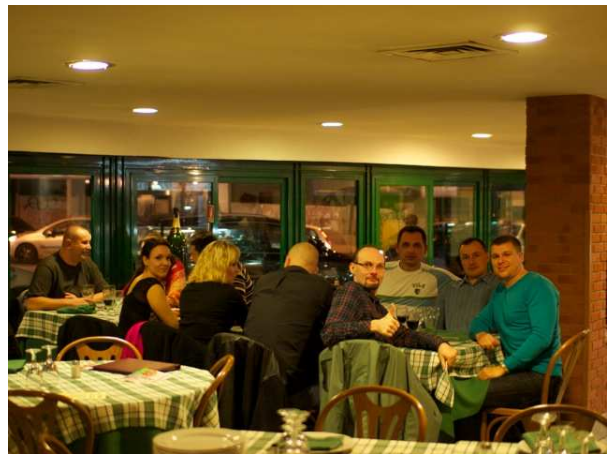
Students' favourite dining place in Naples

Pizza is outstanding, wine as well. Getting back to hotel. Interesting, will Darcy survive the first night with me?