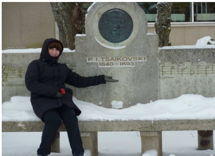
Tchaicovsky's bench.

Nowadays the Castle is known by the White Lady's Legend and every year in August the dramatic play takes place on a territory of the Castle where at midnight on a full moon the ghost of White Lady appears on a window.