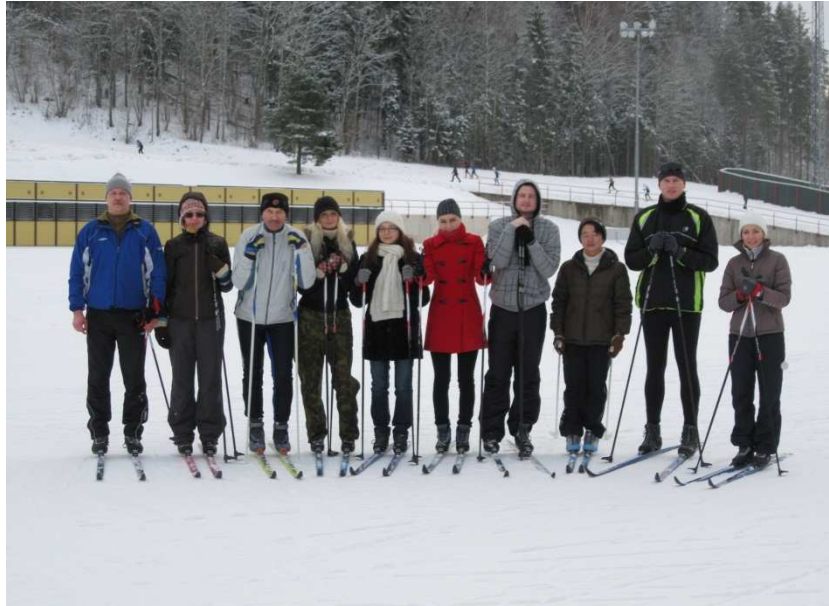
Civil Servants Course's ice breaking event in Otepää.

The long waited integration took place on the 6th February when the civilians were merged with the JCGSC. Although there were concerns about how smoothly the integration will go and about possible problems that may arise,